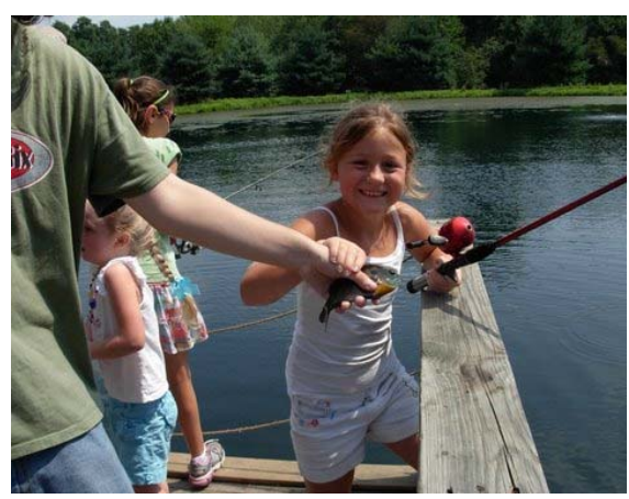
Be ye fishers of men...and an occasional fish