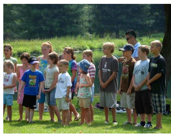
Sunday School singing at our annual church picnic